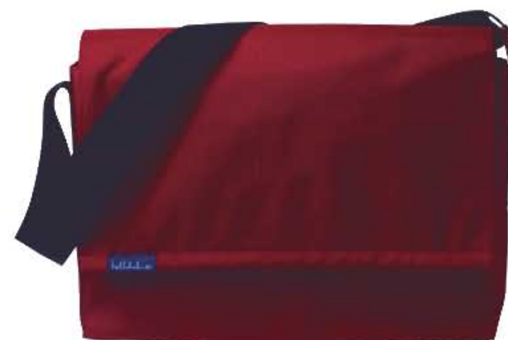
50012-03 COL./ RED EARTH / PLUM