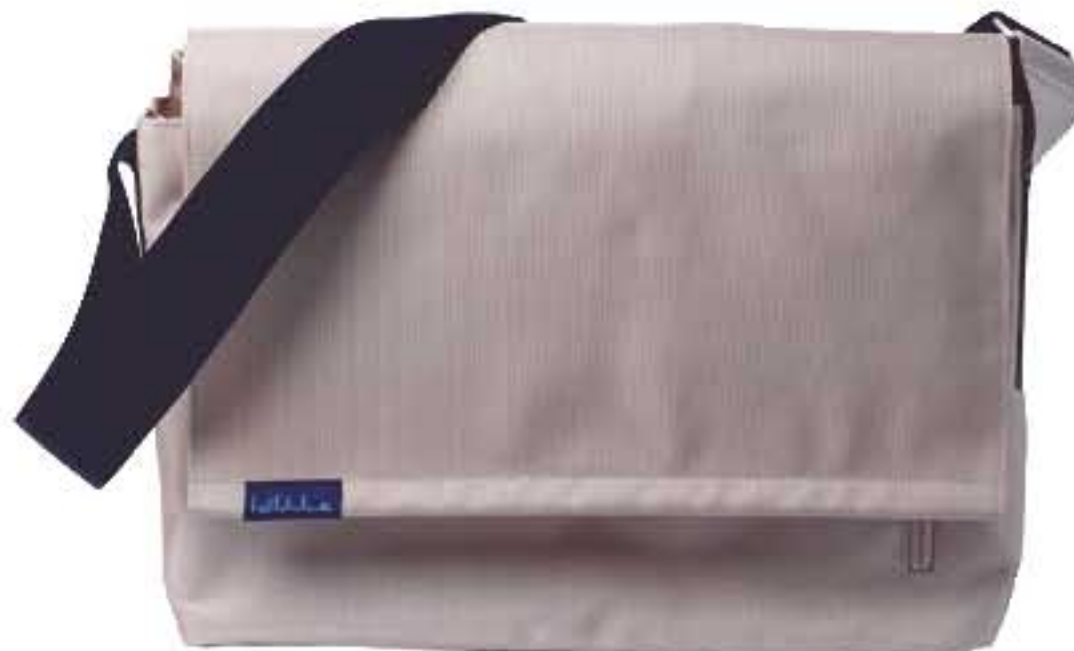
50012-01 COL./ BUCKSKIN / ESPRESSO