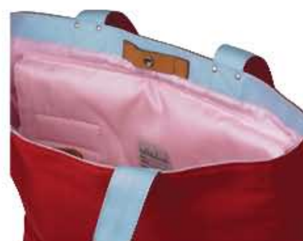
50017-02 COL/ RED PEPPER