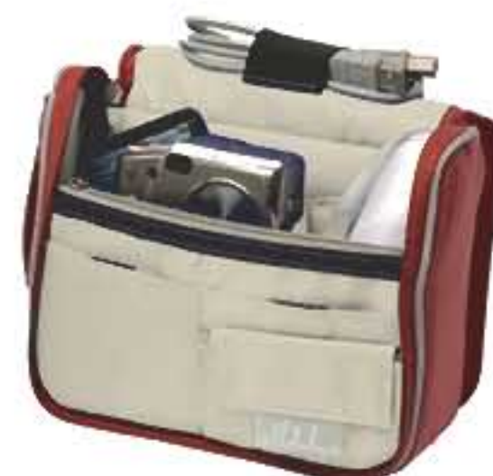
50023-01 COL/ BURGUNDY