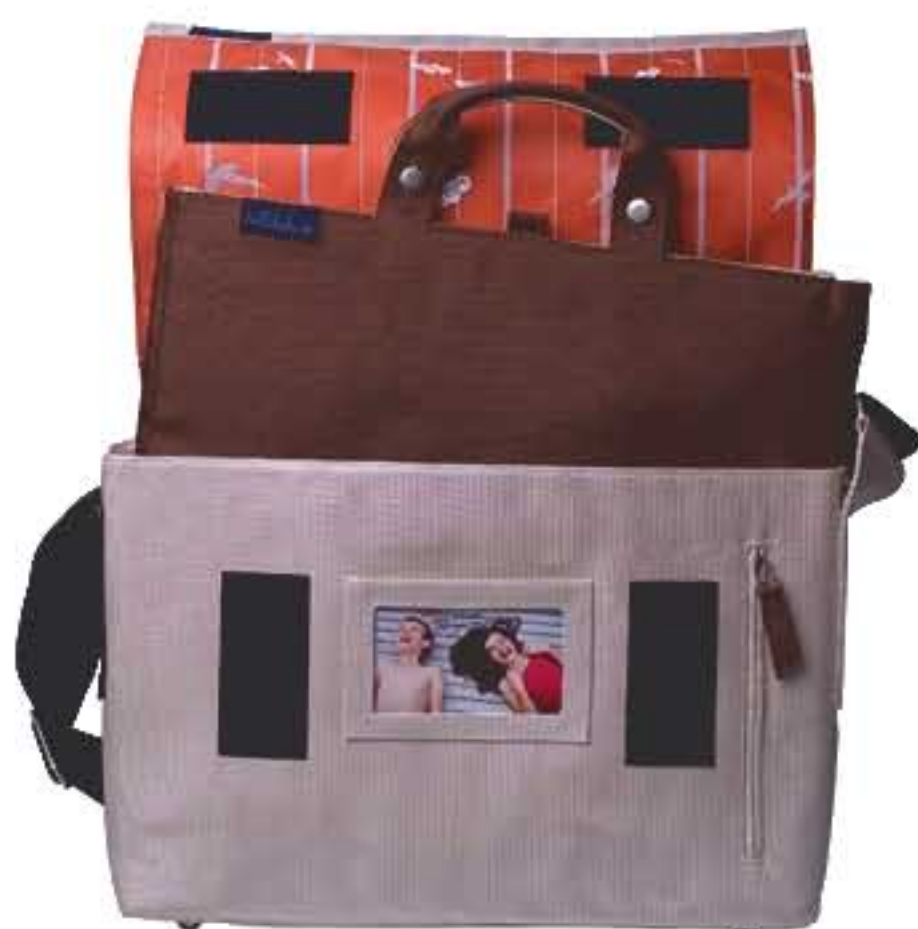
LAPTOP MESSENGER BAG