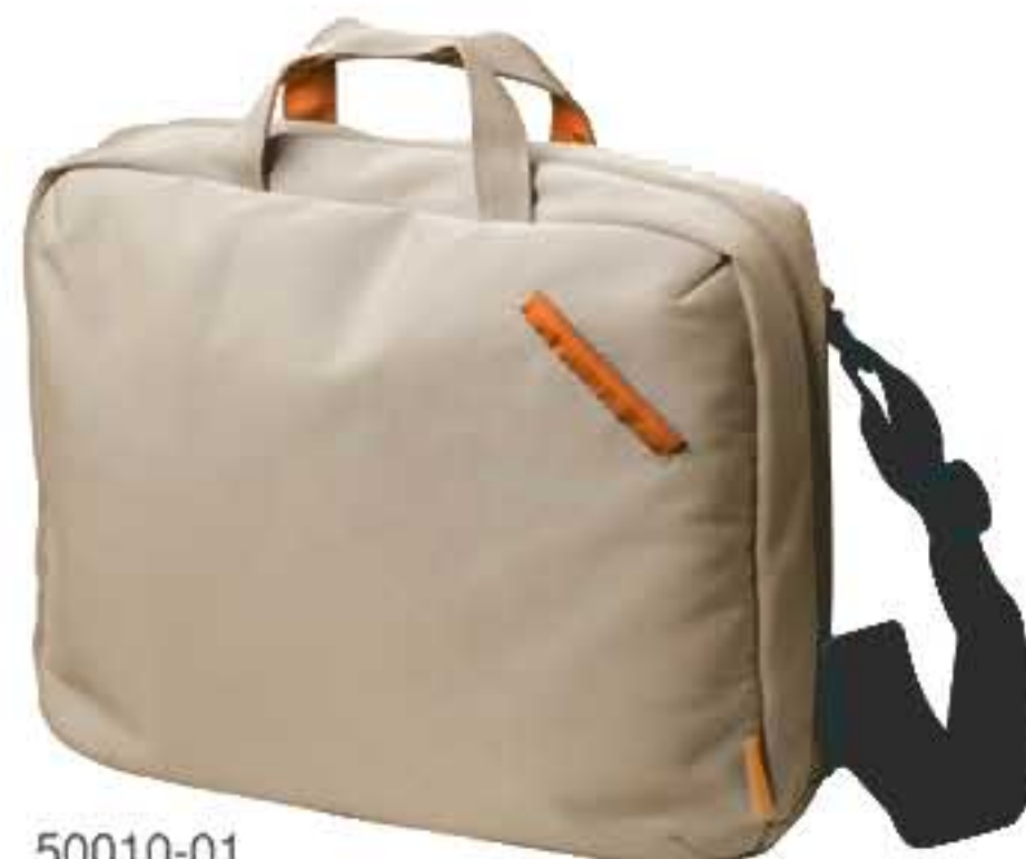
50010-01 COL./ BUCKSKIN

No matter where your destination, make sure you are traveling with 10+. Designed for the man on the go, 10+ delivers all the storage you need for your laptop, all packed in a sleek and colourful design. Not only does it give utmost protection to your laptop, there is plenty internal storage for all types of laptop gear to keep them all in place.