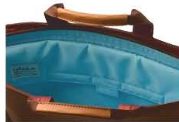
50020-01 COL./ ESPRESSO