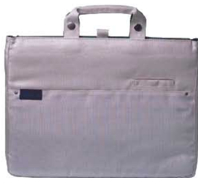
50014-01 COL./ PEARL