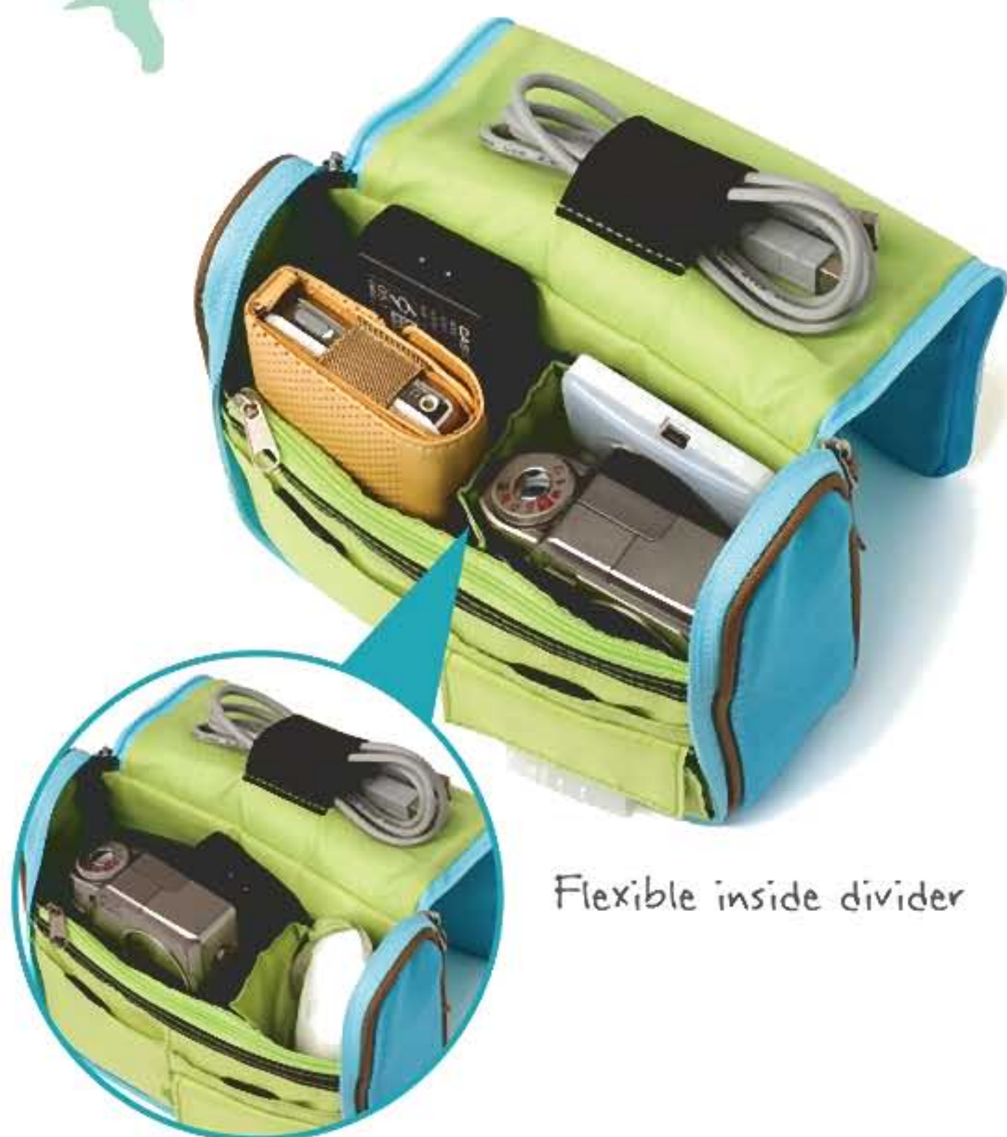
Flexible inside divider