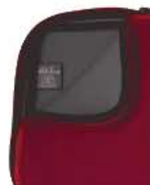
50024-02(13.3" macbook / 13.3" Screen Size) 50025-02(15.4" macbook pro / 15.4" Screen Size) 50026-02(17" powerbook / 17" Screen Size) COL./ BURGUNDY