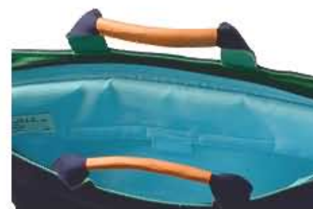
50019-02 COL./ ROYAL BLUE