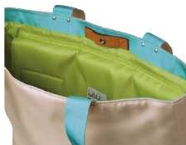
50018-02 COL./ BUCKSKIN