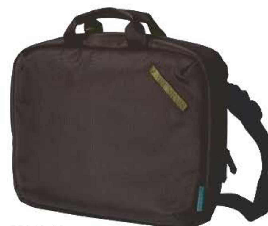
50010-03 COL./ REED