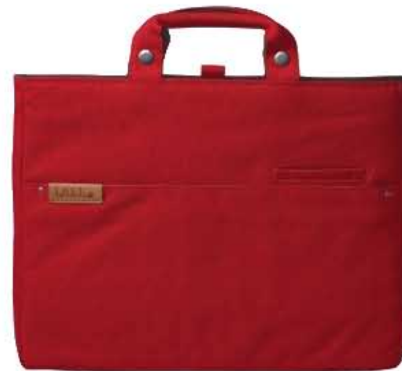
50013-02 COL./ RED PEPPER