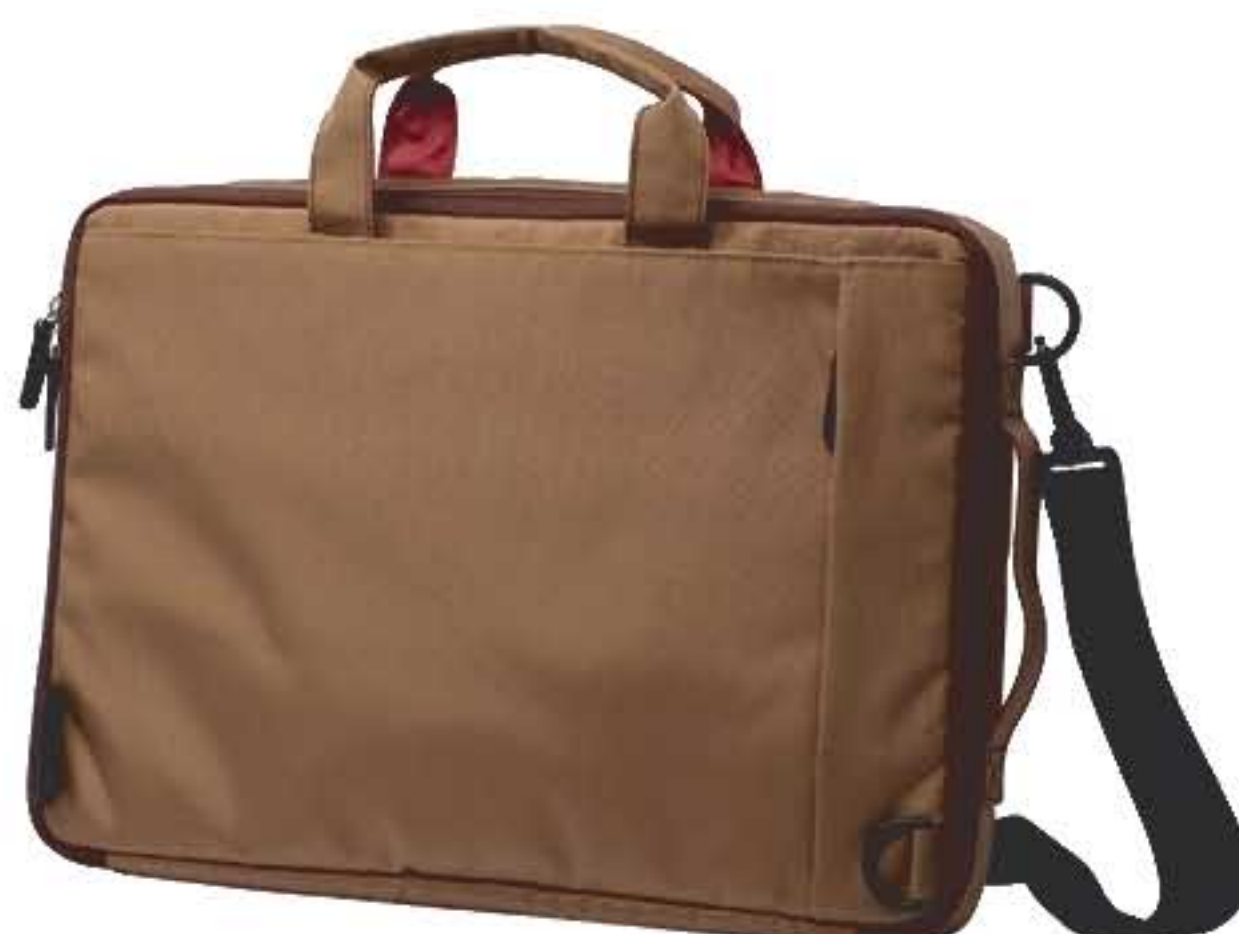
50015-01(13.3" macbook / 13.3" Screen Size) 50016-01(15.4" macbook pro / 15.4" Screen Size) COL/ SERGEANT