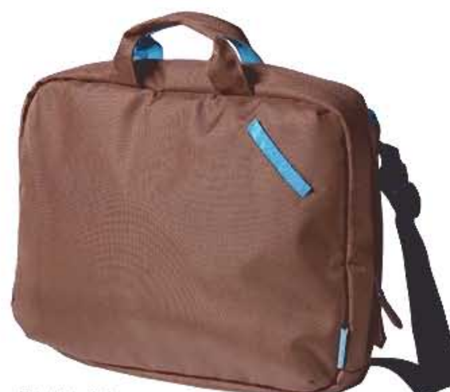
50010-04 COL./ CAPPUCCINO