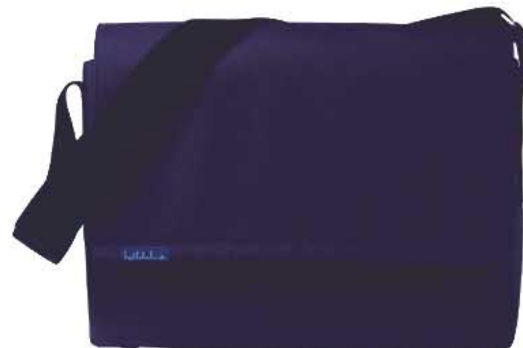
50012-02 COL./ ROYAL BLUE / MUSTARD YELLOW