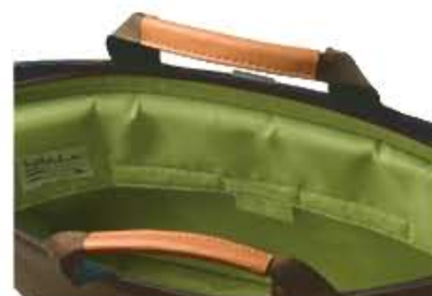
50020-02 COL./ REED