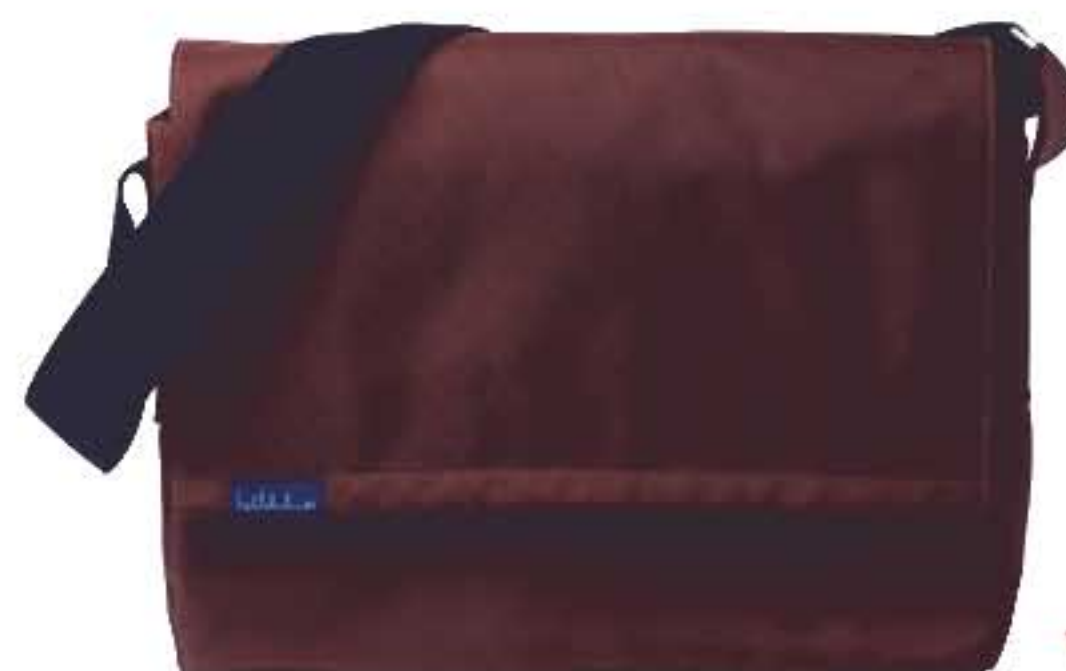
50012-04 COL./ ESPRESSO / SESAME