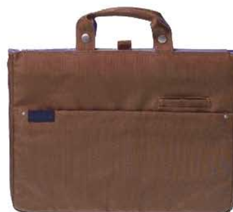
50014-04 COL./ OLIVE