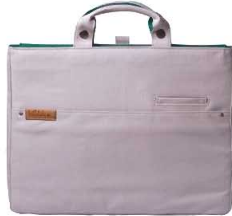
50013-01 COL./ VANILLA