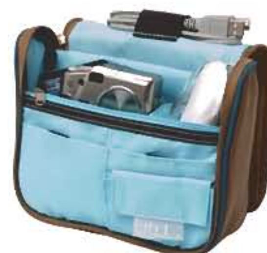
50023-02 COL/ SERGEANT