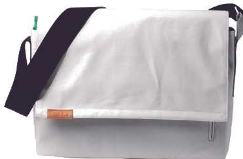
50011-01 COL./ VANILLA / FROG

CAPACITY: UP TO 15.4" macbook pro / 15.4" Screen Size Laptop