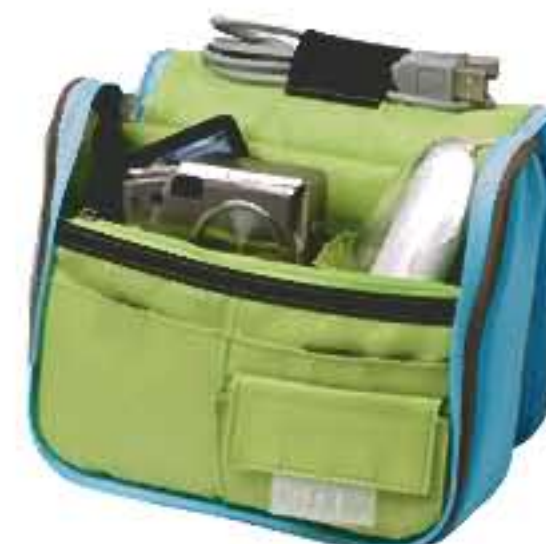
50023-03 COL/ TRUQ