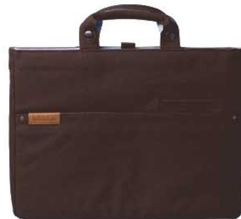
50013-03 COL./ COFFEE