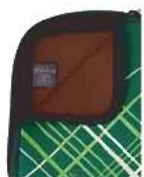
50024-04(13.3" macbook / 13.3" Screen Size) 50025-04(15.4" macbook pro / 15.4" Screen Size) 50026-04(17" powerbook / 17" Screen Size) COL./ GREEN