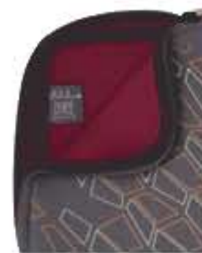
50024-01(13.3" macbook / 13.3" Screen Size) 50025-01(15.4" macbook pro / 15.4" Screen Size) 50026-01(17" powerbook / 17" Screen Size) COL./ GREY