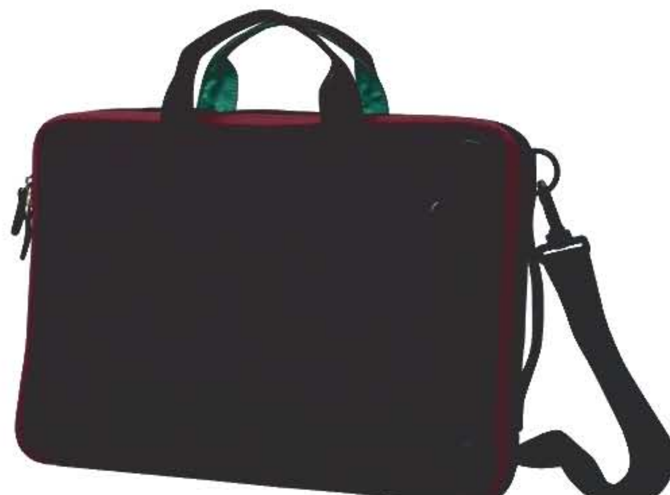
50015-01(13.3" macbook / 13.3" Screen Size) 50016-01(15.4" macbook pro / 15.4" Screen Size) COL/ BLACK