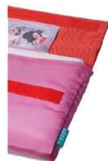
50007-02(13.3" macbook / 13.3" Screen Size) 50008-02(15.4" macbook pro / 15.4" Screen Size) COL./ SHERBET