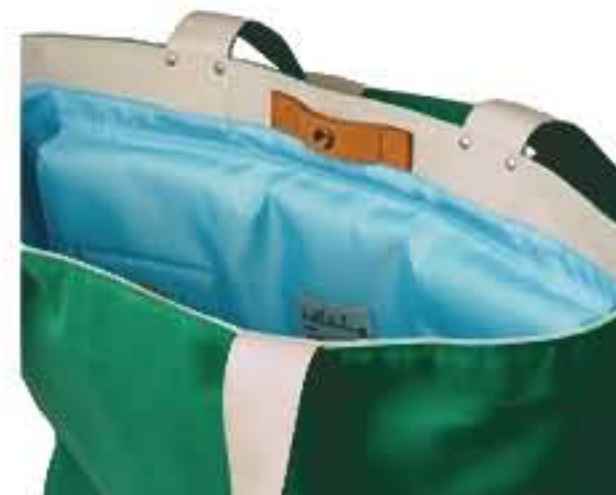
50017-01 COL/ FROG