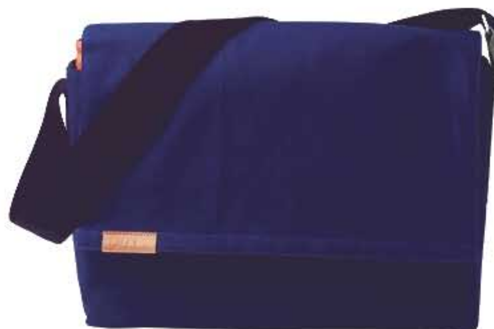
50011-02 COL./ ROYAL BLUE / TANGELO