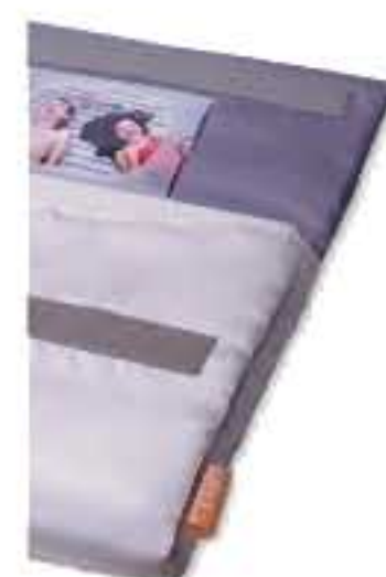
50007-01(13.3" macbook / 13.3" Screen Size) 50008-01(15.4" macbook pro / 15.4" Screen Size) COL./ SNOWMAN