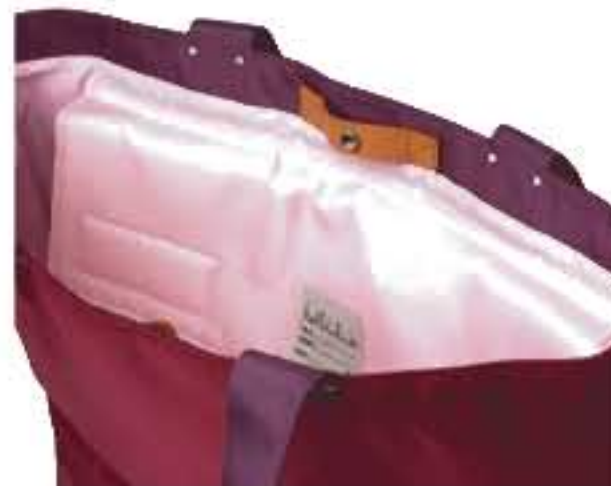
50018-01 COL./ MULBERRY