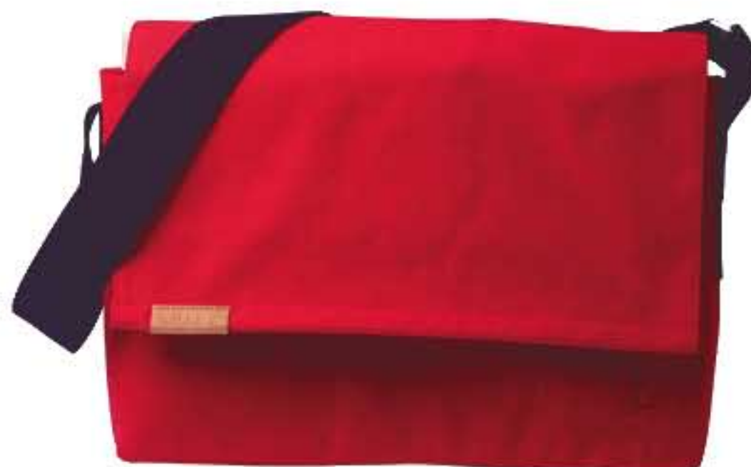
50011-03 COL./ RED PEPPER / VANILLA