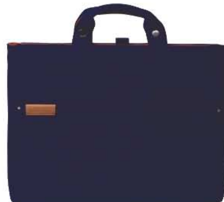
50013-04 COL./ ROYAL BLUE