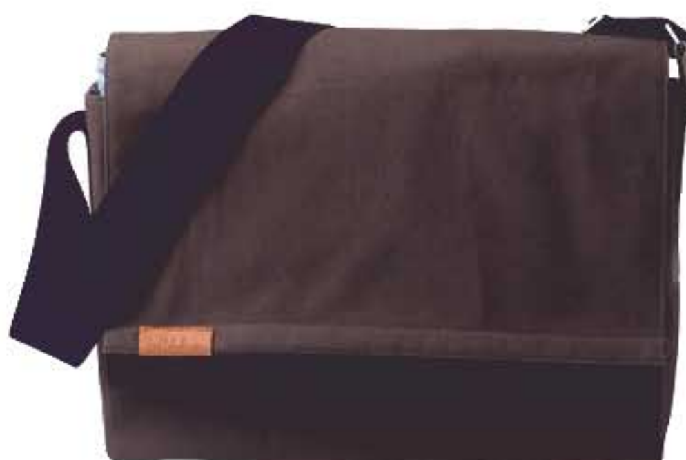
50011-04 COL./ COFFEE / SKY BLUE