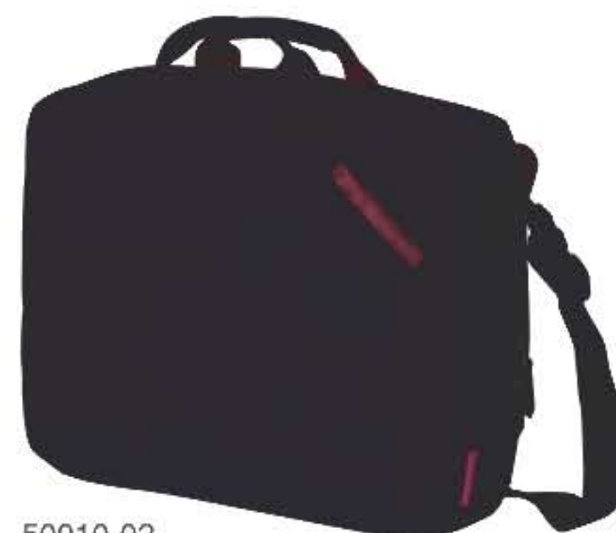
50010-02 COL./ BLACK