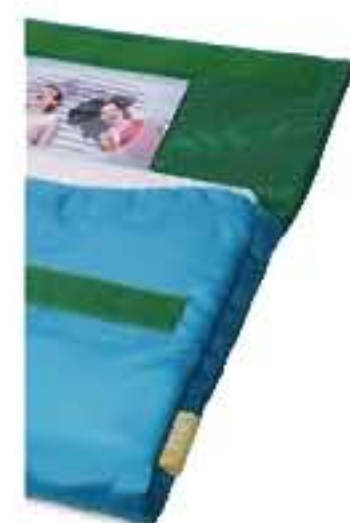
50007-03(13.3" macbook / 13.3" Screen Size) 50008-03(15.4" macbook pro / 15.4" Screen Size) COL./ TURQ