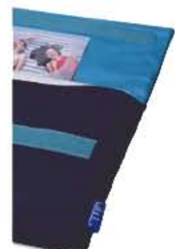
50007-05(13.3" macbook / 13.3" Screen Size) 50008-05(15.4" macbook pro / 15.4" Screen Size) COL./ DEEP NAVY