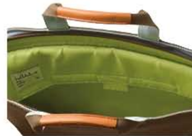
50019-01 COL./ COFFEE