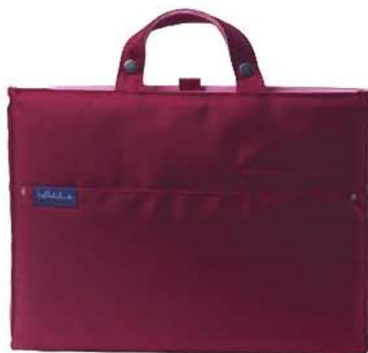
50014-02 COL./ MULBERRY