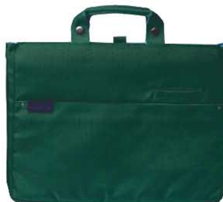
50014-03 COL./ WATERMELON